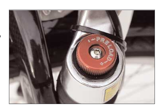
Turning knob for the pre-load of the suspension forks MEKS Carbon AC and MEKS Carbon All

The knob must turn easily. If a knob does not turn any further you have reached the final position. In that case turn the knob again in the other direction about half a turn.